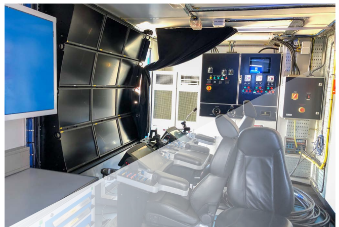
ROV control cabin