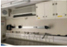
16ft. A60 pressurized cabin Certified to DNV 2.7-2 8' x 16' x 9'