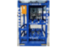
12-3 Acetylene/oxygen rack 3'9" x 4'3" x 6'10"