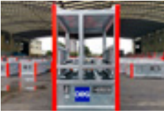
10-4 Acetylene/oxygen rack 4'6" x 6' x 7'4"