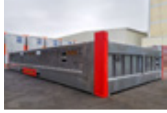
Cargo baskets Removable side door 12' x 24' x 4' 12' x 27' x 4'