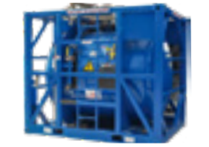
50BBL acid tank Horizontal 8' x 10' x 8'6"