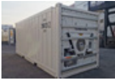
20ft reefer container No genset - 480V 3 ph power 8' x 20' x 8'6"