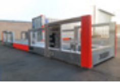
20ft grating rack 4' x 20'