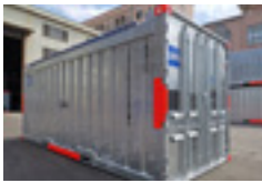
20ft open top 8' x 20' x 8'6"