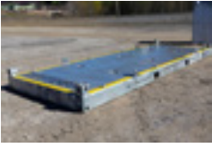
12ft transporter 4' x 12' 15ft transporter 8' x 15' 24ft transporter deck 50,000 lb (lightweight) 8' x 24' 24ft transporter skid 100,000 lb (heavyweight) 8' x 24'