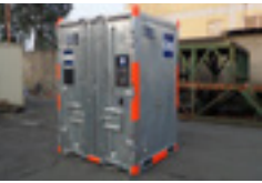
6ft mini container Enclosed/shelf 6' x 6' x 8'