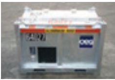
Tool box 3' x 3' x 4'