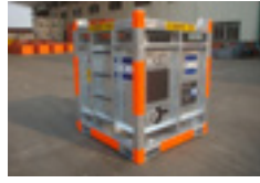
Single DNV tote tank/IBC carrier 6' x 5' x 8'