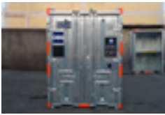
6ft mini tall container Enclosed/shelf 6' x 6' x 9'