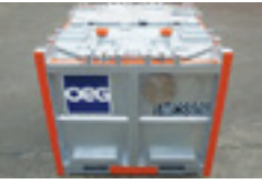
15BBL cuttings box 5'6" x 7' x 4'