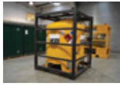
766 Gallon Jet A-1 fuel tank 6'4" x 6'4" x 8'

If you can't see the size you need contact OEG for a custom build to suit your requirements.