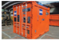
10ft open top 8' x 10' x 8'6"