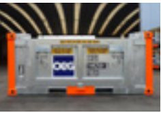
8ft half height With door 8' x 8' x 4' 10ft half height With door 8' x 10' x 4'