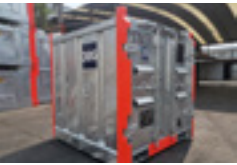
5ft container Enclosed 5' x 5' x 5'