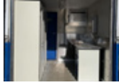
10ft safe area workshop 8' x 10' x 9'