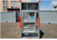
6 bottle rack 3'5" x 3'5" x 7'