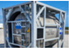
50BBL SS Chemical Tank Horizontal 8' x 10' x 8'6"