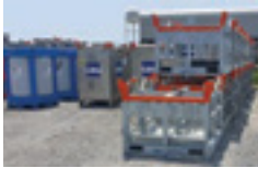
4/Bay drum rack 5' x 5' x 4'6"