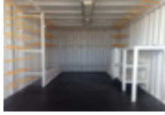
20ft rigging loft/toolbox 8' x 20' x 8'6"