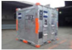
8ft container Enclosed 8' x 8' x 8'6" 10ft container Enclosed 8' x 10' x 8'6"