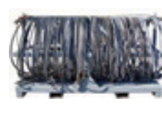
Pipe slings 3/4" x 30' & 35' with clamp 7/8" x 30' with clamp 1-1/8" x 35' with clamp 1-1/2" x 35' with clamp 50 sling rack 5' x 6' x 7'4" 100 sling rack 5' x 12' x 7'4"