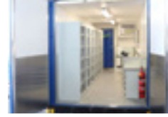
20ft safe area workshop 8' x 20' x 9'