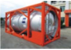
125BBL SS Chemical Tank Horizontal 8' x 20' x 8'6"