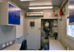
20ft. A60 pressurized cabin Certified to DNV 2.7-2 8' x 20' x 9'