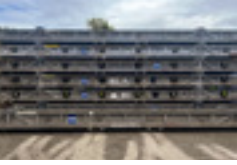
25ft cargo basket 4' x 25' x 1'5"