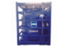
25BBL acid tank Vertical 6'6" x 6'6" x 8'6"