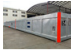
Cargo baskets - super size 81ft 4' x 80' x 4' 90ft 4' x 90' x 4' 92ft 4' x 92' x 4'