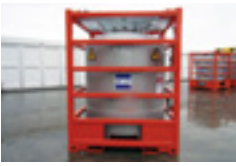
25BBL SS Chemical Tank Vertical 6'6" x 6'6" x 8'6"