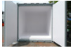
10ft insulated container 8' x 10' x 8'6" 20ft insulated container 8' x 20' x 8'6"