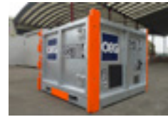
SST/Open top pallet box Swing door 6' x 6' x 6'