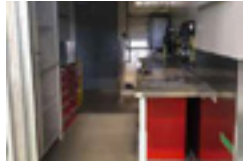
16ft class 1, division 2 workshop 8' x 16' x 8'6"