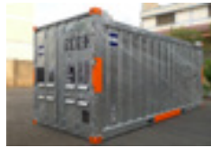
20ft container Enclosed Available in high cube (9'6" tall) 8' x 20' x 8'6"