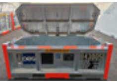
Tool box with alum lid 4' x 6' x 4' 4' x 8' x 3'