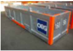
Cargo baskets - mid size With tie downs 16ft 4' x 16' x 4' 20ft 4' x 20' x 4' 27ft 4' x 27' x 4' 33ft 4' x 33' x 4'