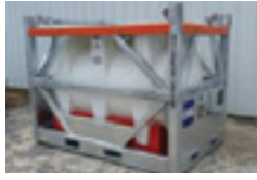
550 gallon acid poly tote tank 5' x 7'8" x 6'