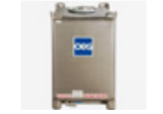
350 gallon SS tote tank 4' x 3'6" x 4'5"