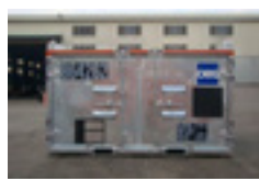
Mini double wide pallet box Enclosed 8' x 5' x 5' Double wide pallet box Enclosed 12' x 5' x 5'