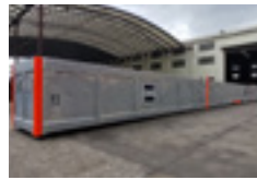
Cargo baskets - long With tie downs 53ft 4' x 53' x 4' 60ft 4' x 60' x 4' 65ft 4' x 65' x 4' 75ft 4' x 75' x 4' 78ft 4' x 78' x 4'