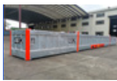
Cargo baskets - large With tie downs 40ft 4' x 40' x 4' 43ft 4' x 43' x 4' 46ft 4' x 46' x 4'