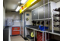
10ft class 1, division 2 workshop 8' x 10' x 8'6"