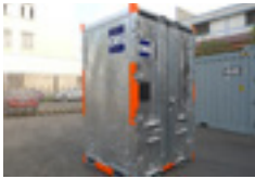
6ft double tall container Enclosed/shelf 6' x 6' x 10'