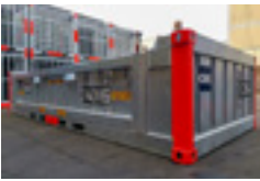
12-30ft half height baskets Removable side door 8' x 12' x 4' 8' x 16' x 4' 8' x 20' x 4' 8' x 24' x 4' 8' x 28' x 4' 8' x 30' x 4'