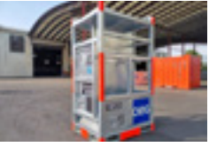
12 bottle rack (tall) 3'8" x 4'6" x 8'