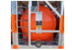
25BBL IM 101 liquid transport Horizontal 6' x 8' x 7'