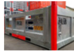
Cargo baskets - 6ft 6' x 12' x 4' 6' x 24' x 4'