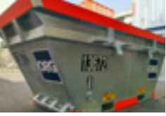
13ft boat skip 6' x 13' x 5'