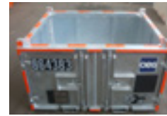
Mini double wide open top pallet box 8' x 5' x 5' Double wide open top pallet box 12' x 5' x 5'