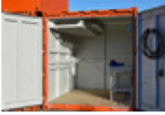
10ft rigging loft/toolbox 8' x 10' x 8'6"