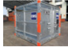
Quad DNV tote tank/IBC carrier 10' x 10' x 9'